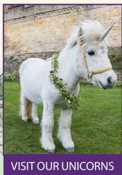
VISIT OUR UNICORNS