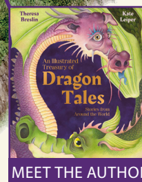
MEET THE AUTHOR