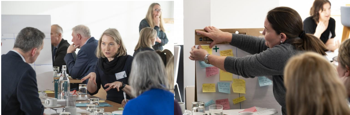
Groups discuss the workshop topics at Scotland's Historic Environment Forum on 7 February 2024

3. What are the challenges/barriers to you/your organisation getting involved in or delivering against the activities and aspirations, and what are some of the solutions?