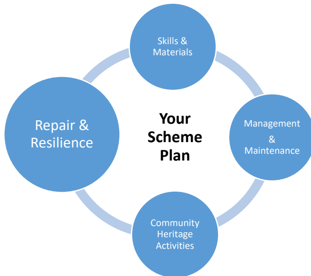
Figure 1: Illustration of Scheme Plan

Further guidance on what we can fund under each theme is outlined in Part 5.