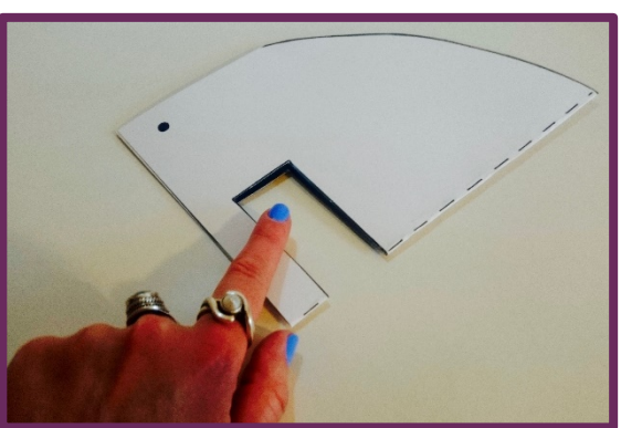
2. Fold your card in half and cut out the rounded corners and the eye slot.