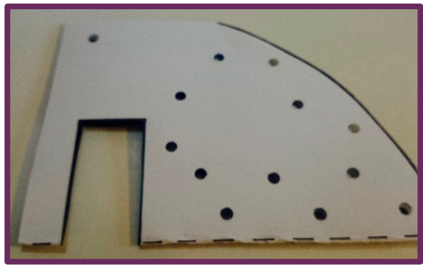
3. Make some breathing holes with a hole punch or by pushing a pencil through the card. (Put Blu Tack on the table and position the card over it so the pencil won't poke your table or your fingers!)