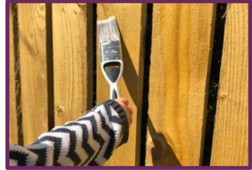
A paintbrush and water is a great way to practice mark making outside on pavements and fences!

We love seeing your #LearningWithHES creations - do share them with us online! Find more activities at: historicenvironment.scot/LearnAtHome