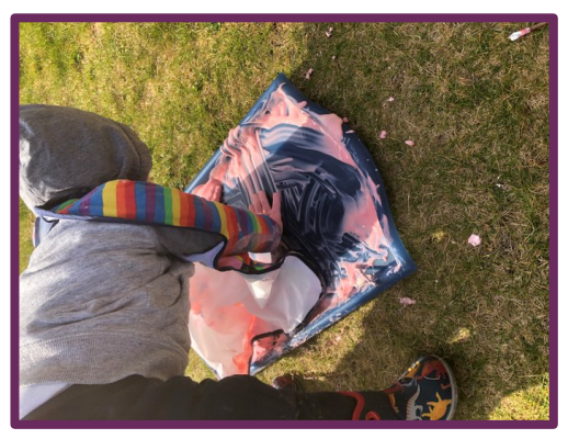
Do wear play clothes as the food colouring may stain!