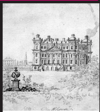
1650 onwards Castles gave way to stately homes