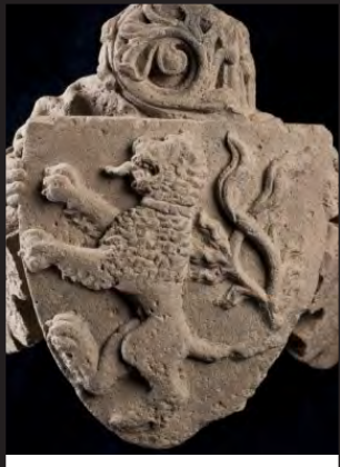
A lion on a shield at Elgin Cathedral