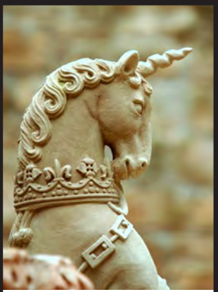
Part of the fountain at Linlithgow palace

They were used to decorate the buildings, impress people, and as symbols of power.