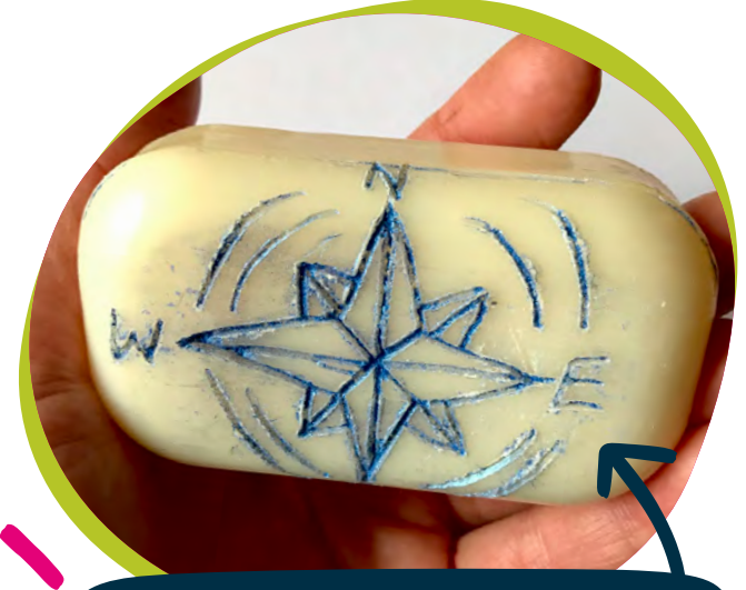
This soapmason has carved a compass. They were inspired by Trinity House maritime museum.