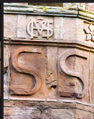
Letters carved at Huntly Castle