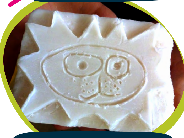
This soapmason has carved a lion. The lion is a royal symbol and can be found in castles across Scotland.