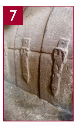
Whereabouts can you find these buckles carved out of stone?