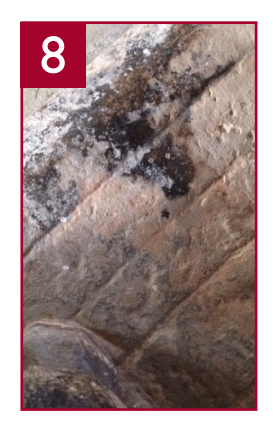
Can you see this sword carved in the stone? Where is it?