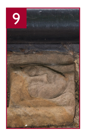
This face seems to have been carved sideways. Can you find it?