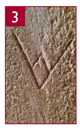
The men who built the church made marks on the stones. What would your mark look like?