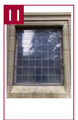
church are arched, but two are square or oblong. Where are they?