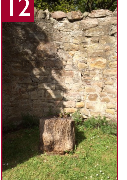
What might you find in this corner?