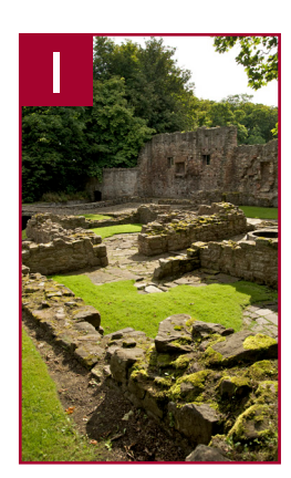
Look up at the high wall in the Priests' House. How many floors did it once have?

Explore our church with this fun, fact-finding mission. Remember to ask a steward if you need any help.