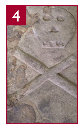
Can you find this strange carving? Whose name is on the stone?