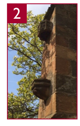
These stone shelves or plinths once supported statues. How many shelves can you count?