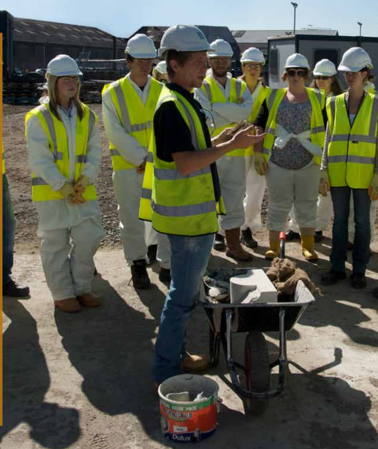
Historic Scotland Energy Efficiency Seminar, Edinburgh

Public Bodies in Scotland are encouraged to make a commitment to address climate change and to demonstrate leadership by sharing best practice and providing advice to others. As a large public body with a significant estate and large energy requirement, Historic Scotland has a duty to act as an exemplar to other organisations and in particular the heritage sector in responding to the climate change agenda. We can use our position to ensure that climate change considerations are embedded into relevant historic environment matters where appropriate. A significant part of our work is to undertake research and disseminate advice and guidance on best practice to improve the management of the historic environment and traditionally constructed buildings. Historic Scotland is committed to working more closely with the historic environment sector and others to deliver our objectives and other common outcomes, including playing an international role to ensure that Scotland contributes meaningfully to the global conservation and the heritage community.