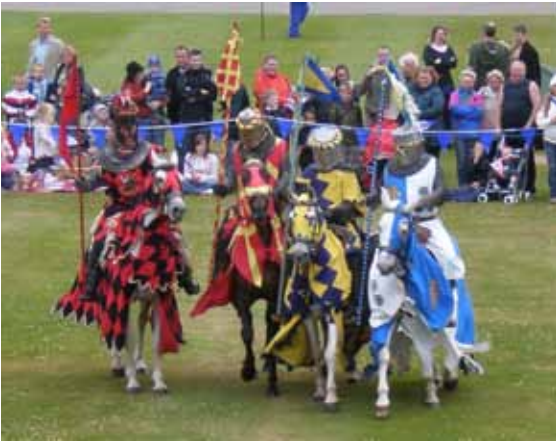
Jousting tournament, Fort George