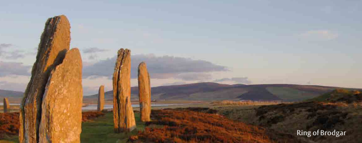
Ring of Brodgar