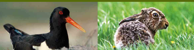
Oystercatcher; Brown hare

This is a living landscape that retains a vibrant cultural importance. The land immediately surrounding the Ring of Brodgar is a nature reserve managed by the RSPB and harbours many important species of wild flowers, insects and birds.