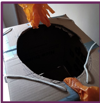
9. Thread a strong piece of thick string between the front and back holes and tie it in a secure knot. These will be the shoulder straps.