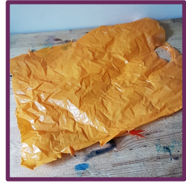
7a. To make the tail: we cut a plastic bag in half.