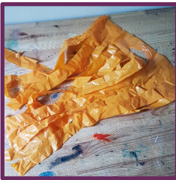
7b. Made cuts in it almost to the top.