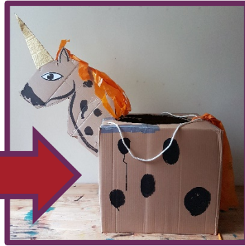
...decorate your horse!