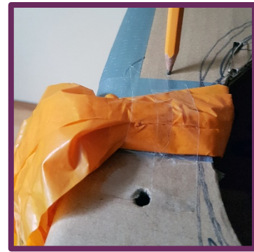
8. Finally, if you want to wear your horse, use a sharp pencil to make 2 holes at the bottom and 2 at the head.