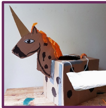
10. Grab your helmet, shield, and lance - you are ready for jousting!