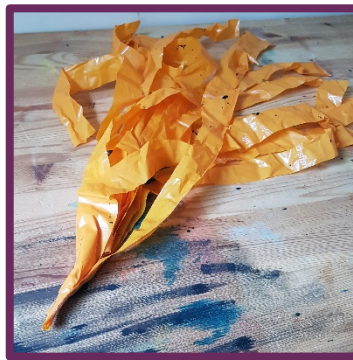
7c. Rolled up the top, taped it, and then stuck it to our horse's bottom.