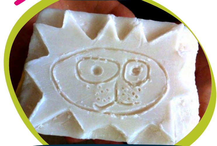
This soapmason has carved a lion. The lion is a royal symbol and can be found in castles across Scotland.