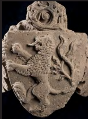
A lion on a shield at Elgin Cathedral