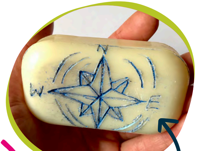
This soapmason has carved a compass. They were inspired by Trinity House maritime museum.

People who carve stone are called 'stonemasons'. Carving stone is difficult if you don't have the right tools, but you can get a good idea of the skills involved by carving soap instead.