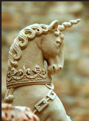
Part of the fountain at Linlithgow palace

They were used to decorate the buildings, impress people, and as symbols of power.