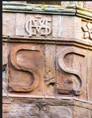
Letters carved at Huntly Castle